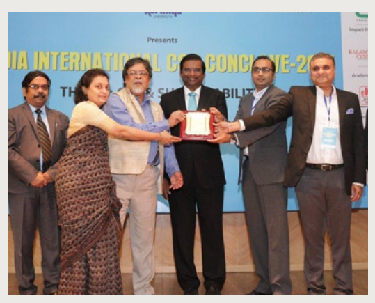
SRLC was conferred with the NGO of the year award at the India International CSR Conclave, 2017