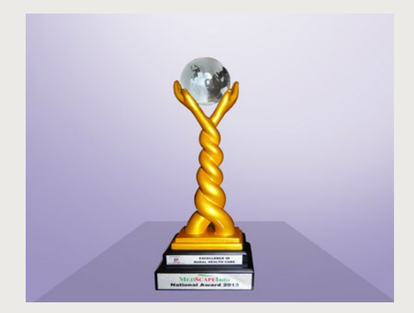
SRLC receiving the Medscape India National Award

SRLC was awarded the Winner, Western Region, for its contribution in the field of Health Care at the 8<sup>th</sup> Spirit of Humanity Awards in 2017